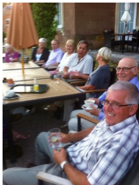
Our last evening at Holme Lacy Soaking-up the late summer sun